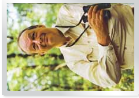
Member Since 1997

NON PROFIT ORG. U.S. POSTAGE PAID PERMIT #186 WESTPORT, CT