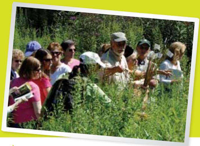
Wildflower hike at Stonebridge Waterfowl preserve.

The Aspetuck Land Trust offers numerous educational and specialty hikes for children and adults that are open to everyone and offer a great way to explore and learn more about the diversity of our 42 trailed nature preserves on over 1,700 acres of open space in our community. Reserve your space early as spaces are limited for these popular hikes. More details on our website.