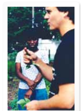
Teaching urban youth about farming in Minneapolis.