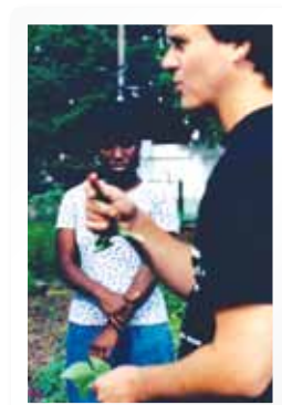
Teaching urban youth about farming in Minneapolis.