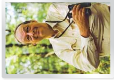
Member Since 1997

NON PROFIT ORG. U.S. POSTAGE PAID PERMIT #186 WESTPORT, CT