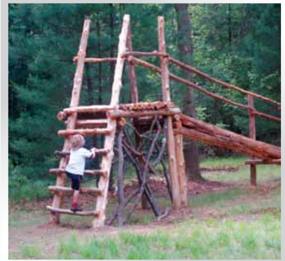
Child playing on tower at Natural Playground.

The Natural Playground at the Leonard Schine Arboretum in Westport was a big success among children and parents! The playground was designed to encourage children, ages 3 – 7, to explore and play creatively outdoors. See our website for more details.