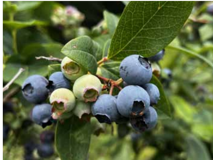
BLUEBERRIES with all of you, our members!