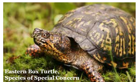
Eastern Box Turtle, Species of Special Concern

At Aspetuck Land Trust we continue to make significant strides in our mission to preserve and protect natural spaces in Fairfield County, Connecticut before they are gone forever. Recently, ALT successfully closed a deal on the 11.5-acre Fratelli Zeta property and is on the verge of another significant acquisition of Belknap II, a 20.7-acre property on the southeast corner of the 705-acre Weston Wilton Forest Reserve.