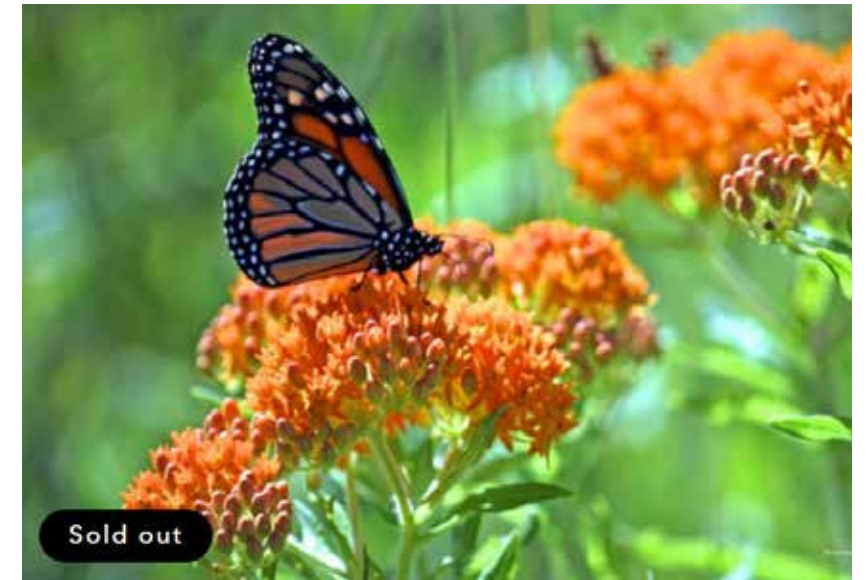
Butterfly Weed (Asclepias tuberosa)

Check out our website for garden plans and all kinds of information about making your yard as healthy and beautiful as it can be. We're here to help!