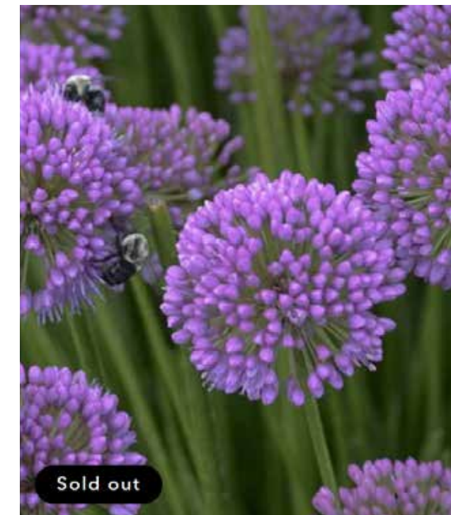
Ornamental Onion (Allium 'Millenium')

Please SHARE! We want to hear from you! On our website's homeowners page, you can now upload pictures from YOUR backyard and let us know how it is going. It is so inspiring to hear from others, like these homeowners: