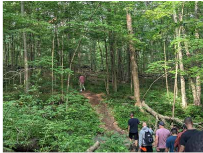
Pivot Ministries of Bridgeport on a hike in Trout Brook Valley

Created 40 years ago in Japan by Dr. Akira Miyawaki, the microforest method is used around the world to increase tree canopy in urban areas. The Bridgeport schools microforest project will be the 1st in Connecticut.