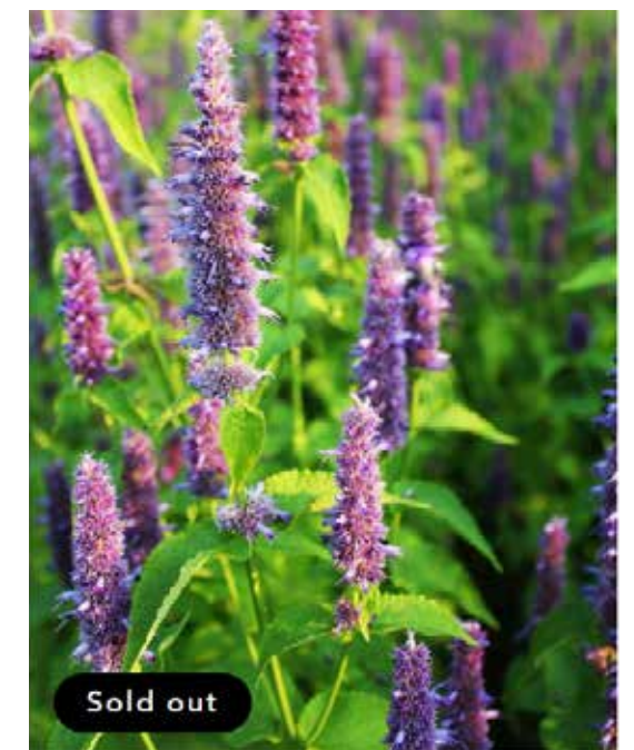
Anise Hyssop (Agastache foeniculum)

"Where a pond once stood are now native cattails. We have worked to remove invasive species and plant natives, as well as protect native patches of Milkweed and Joe-Pye weed."