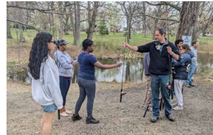
"Fishing with Friends" workshop with Trout Unlimited and CT DEEP at the Beardsley Zoo, thank you to Bass Pro Shops for their generosity - no one left empty handed!