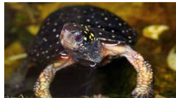
Spotted Turtle, Species of Special Concern

As ALT continues its efforts, the Green Corridor and the WWFR will stand as testaments to the enduring commitment to nature conservation in the region. We would like to thank our supporters; Green Corridor Capital Campaign donors, CT DEEP, the Formanek Foundation, our members, and all who support Aspetuck Land Trust, for making this important work possible. 🌱