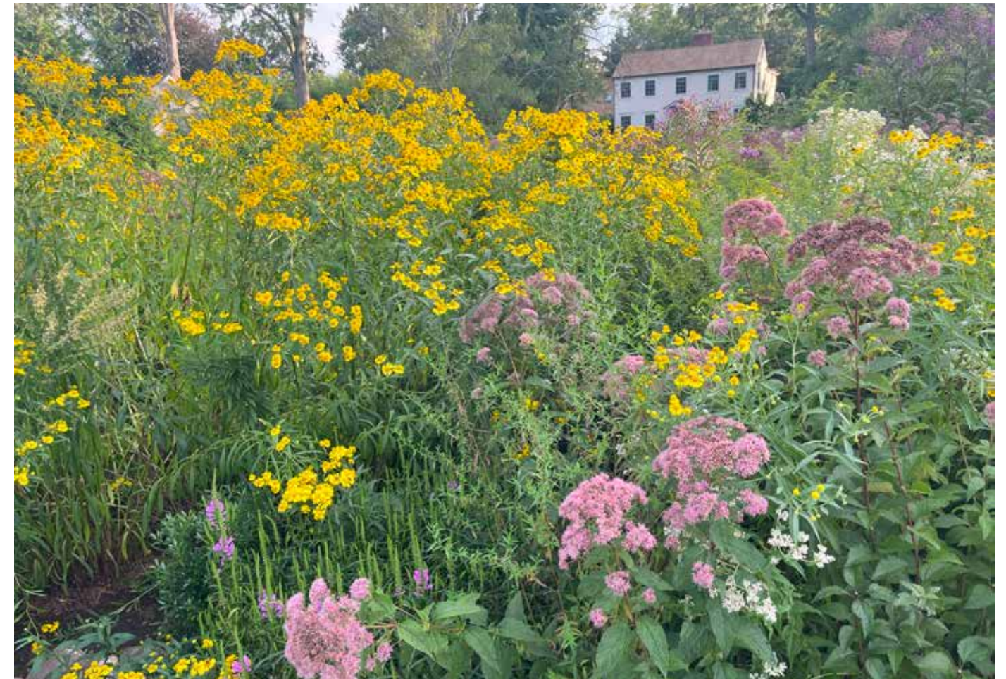
Southport Wildflower Preserve, across from the Pequot Library

Creating Native Landscapes for the Benefit of All