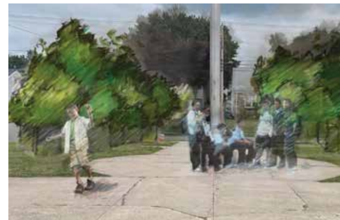
Rendering of a microforest at the entrance of a school

For over 4 decades the benefits of Miyawaki microforests have been proven and well documented in cities around the world including: reducing air pollution, lowering air temperatures, capturing storm water, capturing carbon from the air, increasing diversity of many species of birds and pollinators, reducing energy costs, and improving well-being.