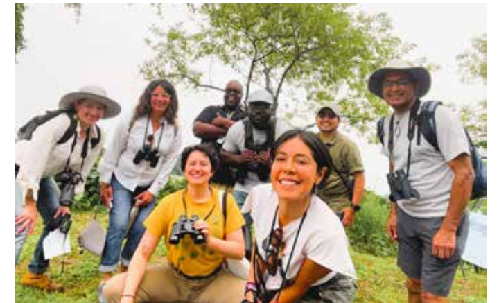
Celebrating Latino Conservation Week with breakfast, a bilingual bird walk led by Yaw from CLCC, and ending with a program at Green Village Initiative