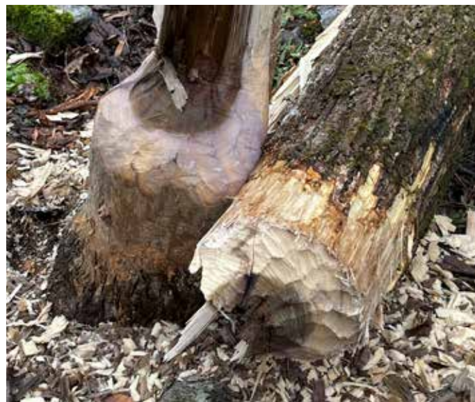
Beaver Activity with Diane Honer