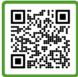
ONLINE GIVING Scan the code above or visit AspetuckLandTrust.org