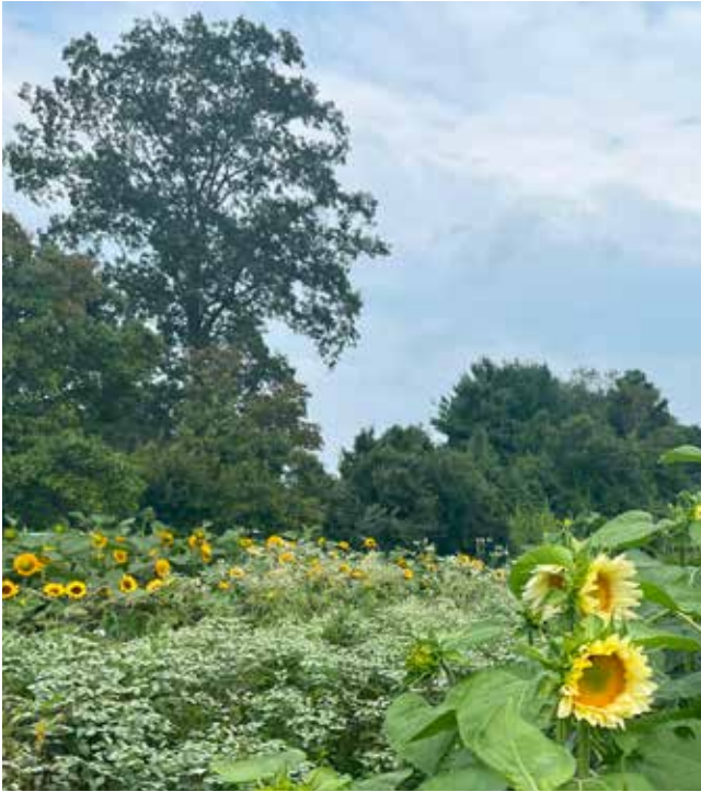
Gilbertie's Organic Farm in Easton, an Aspetuck Land Trust protected property