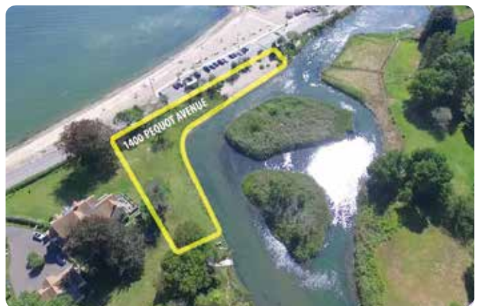
Property across from Southport Beach preserved in 2015.