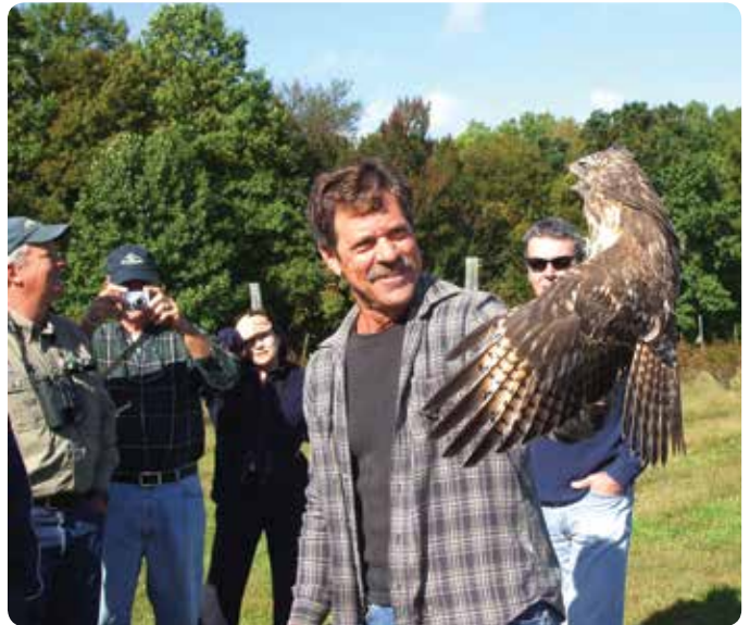
Hawk hike in the Trout Brook Valley Conservation Area, Easton.