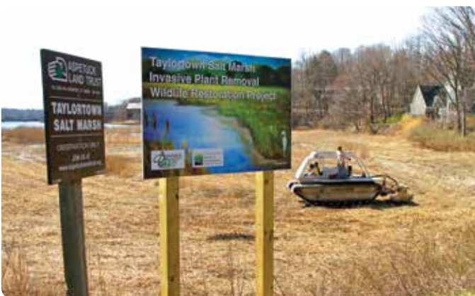
Restoring the Taylortown Salt Marsh in the Saugatuck River in downtown Westport.