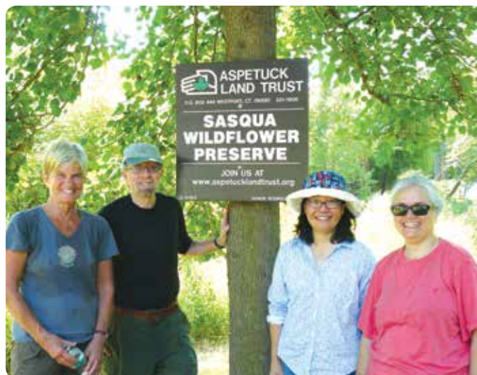
Volunteers planting native plants at the Sasqua Wildflower Preserve, Southport.