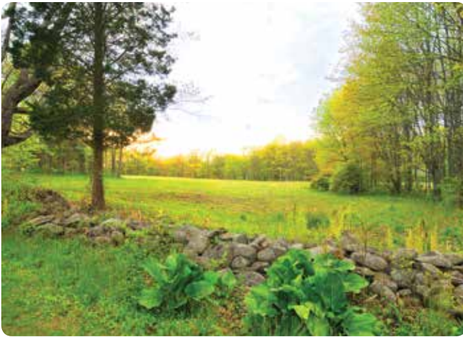
Randall's Farm Preserve in Easton donated by Joan duPont.