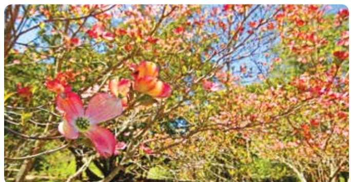
Caryl and Edna Haskins Preserve in Westport.