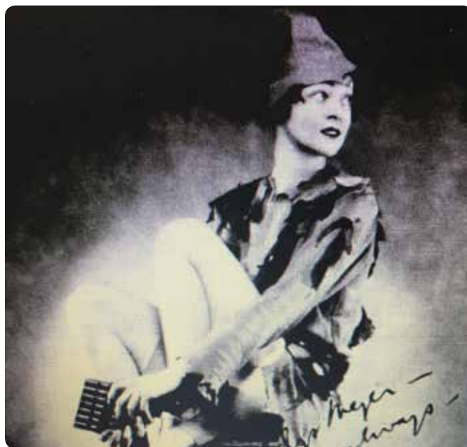
Actress Eva LeGallienne lived in Weston and played Peter Pan on Broadway.