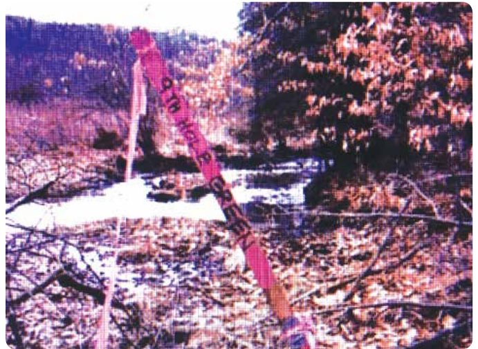
Ninth hole green location in Trout Brook Valley planned by the developer.