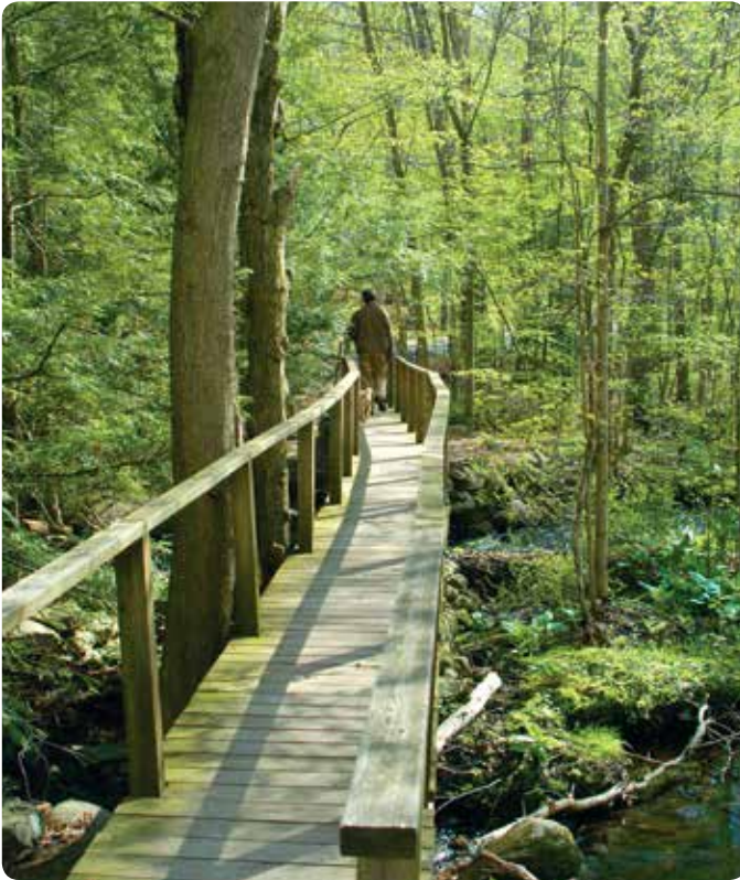
Stonebridge Waterfowl Preserve, Weston.