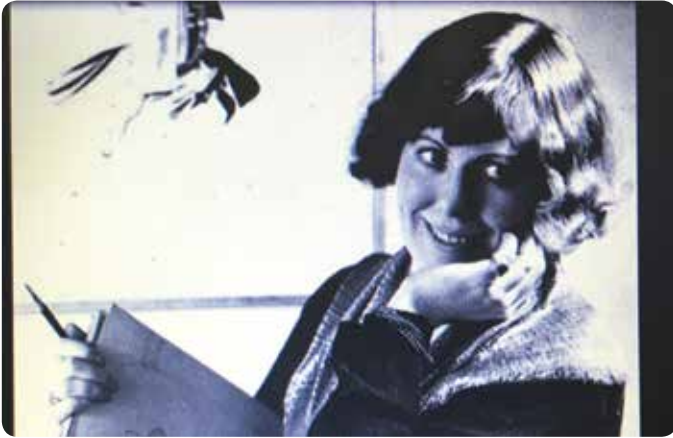
Artist Hilla von Rebay.