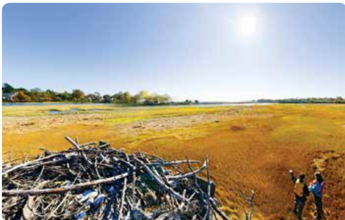
Great Salt Marsh Island Preserve in Ash Creek in Bridgeport.