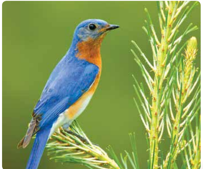
ALT improves habitat for the Eastern Blue Bird.