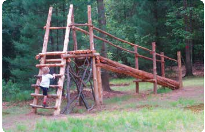
Natural Playground at the Leonard Schine Preserve, Westport.