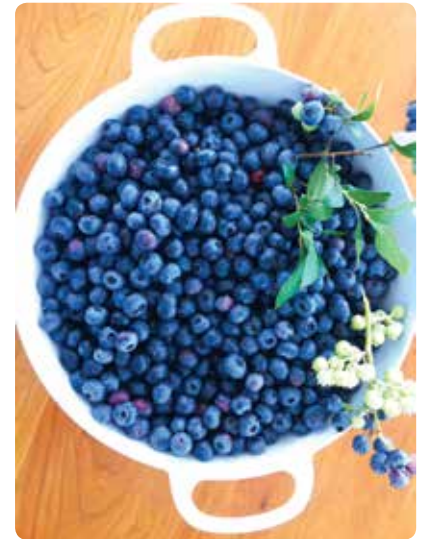
ALT blueberries.

As we celebrate our half century of preserving land, we also want to set the stage for the next 50 years. To enable us to continue to deliver on our mission to "preserve open space, farm and forest land and natural resources in the towns of Easton, Weston, Fairfield and Westport for the benefit and education of the public" we have set an ambitious goal for our 50th Anniversary year. To be a more powerful environmental organization, we want to increase our ranks to 1,000 members! For every new member, we can preserve more land. If you're not a current member, please join us by making a tax-deductible donation today. Already a member? Help us spread the word by sharing your love for our environment with friends and family or giving them the gift of membership.