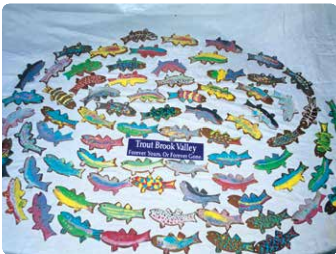
Trout cookies were sent to 130 CT legislators during the Save Trout Brook Valley campaign.