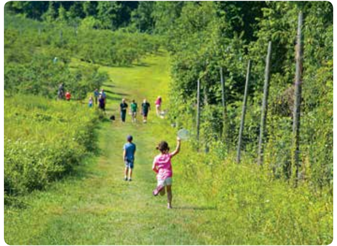
Running to pick blueberries in Trout Brook orchard. ALT maintains 800 blueberry bushes for picking by ALT members only.