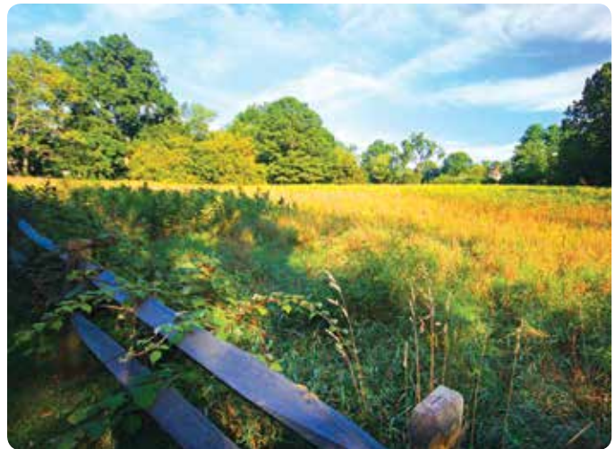
Old Hay Field Preserve, Fairfield.