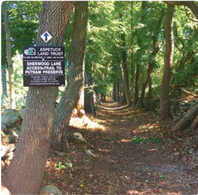
Entrance to the Putnam Preserve in Fairfield is down an old pent road which was used by local farmers to transport onions to Southport Harbor.