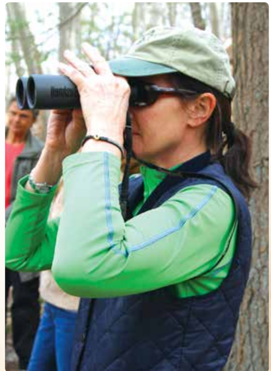
Bird watcher on an ALT Educational hike.

From intersection of Merritt Parkway and Rte. 58 (Hi Ho Motor Inn), go north on Rte. 58. Pass thru light at Rte. 136, continuing on 58. Pass Bluebird Gas Station and Restaurant on left. After Bluebird take third left (Redding Rd and Norton Rd are 1st two roads) onto Freeborn Road (sign at end of road) which is a couple of miles from Bluebird. Go left onto Freeborn. There will be woods on the left and right. When the woods stop on left (first house lot) look to right, there will be a dirt road thru the woods. Go up the dirt road, pass thru an 8 ft. farm gate into a field where you will park.